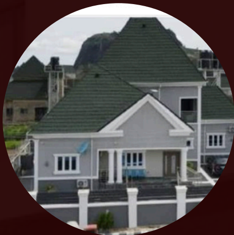
Liberty Hills Estate Jikwoyi