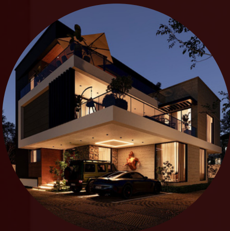
LIBERTY GARDENS REHOBOTH ESTATE LIFECAMP