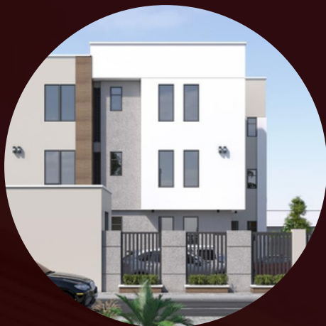
liberty estate sheretti