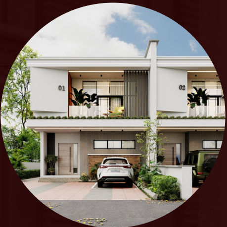
Liberty estate kuje