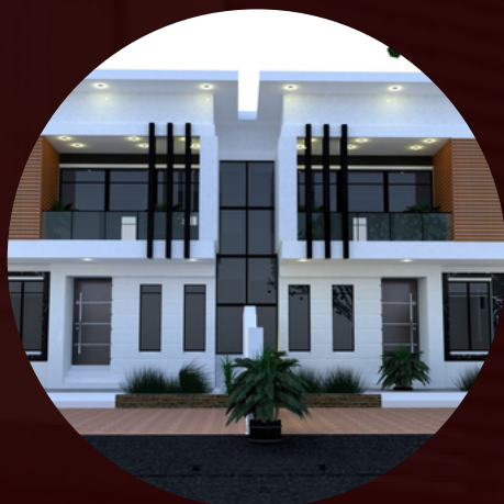
Liberty Hills Estate (Phase two) Kurudu